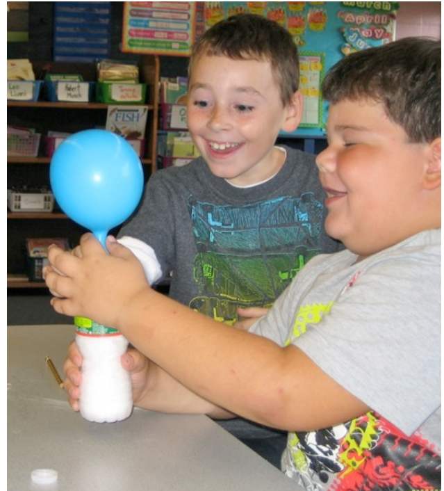
Blowing up a balloon with baking soda and vinegar in Super Science