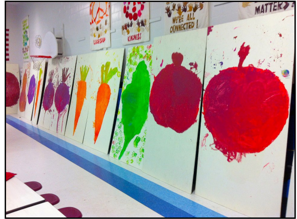
Student artwork for display at Burlington International

For the second year in a row, more than 95% of parents who responded to our annual survey reported being "Satisfied" or "Very Satisfied" with the program.