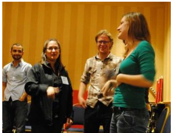
Over 300 participants attended the Vermont Afterschool Conference in South Burlington on October 21, 2011.