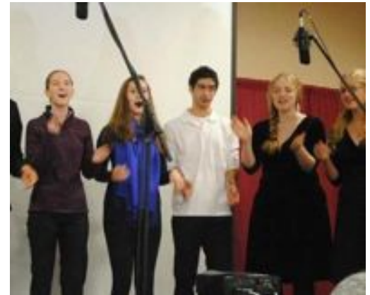
South Burlington High School Chamber Singers opened the conference morning with song.