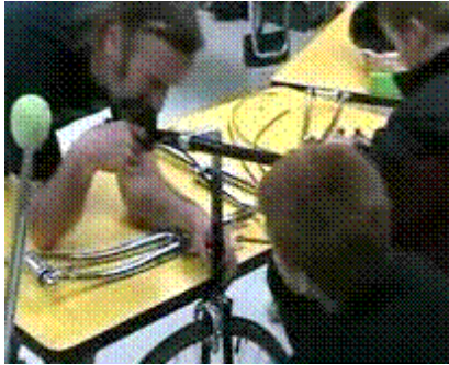
Winner of the 2009-2010 Student Produced Video— Vergennes Middle School Bicycle Works