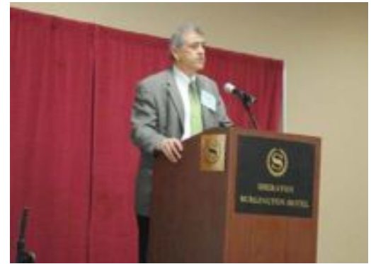
Education Commissioner Armando Vilaseca welcomes attendees to the 2011 Vermont Afterschool Conference.