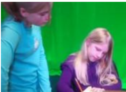
Winner of the 2010-2011 Middle/High School Video— AIM Afterschool at Bellows Falls Middle School, Television Production