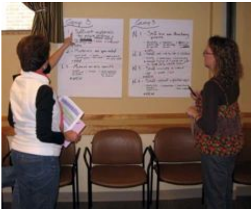
Program leaders discuss how to recognize quality in an afterschool program and what measures they could put in place to strengthen their own programs.