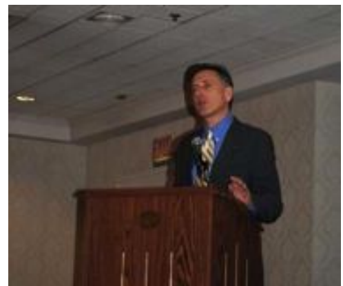
Governor Shumlin speaks about the importance of dedicated educators and out-of-school time programs.