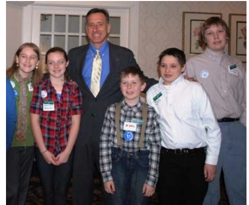
Governor Shumlin meets with student ambassadors at the 2011 Vermont Afterschool Legislative Day.