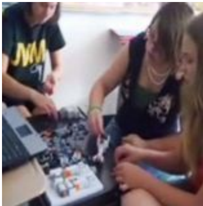
Winner of the 2010 Summer Middle/High School Program Video— Tech Savvy Girls Summer Camp