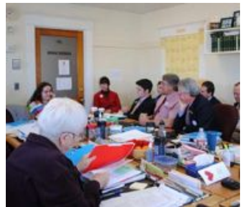
Students testify before the House Human Services Committee about quality afterschool programs.