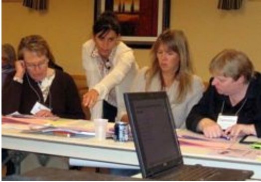
Participants in the Vermont pilot on youth program quality assessment and improvement work with the trainer from the David P. Weikart Center for Youth Program Quality.