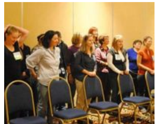
Conference attendees from all over the state of Vermont actively participating in an engaging workshop.