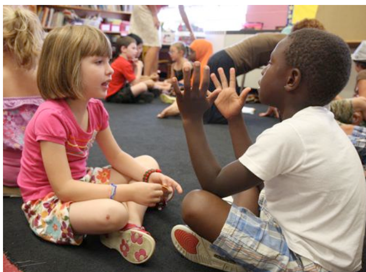
First grade students at JFK Elementary's Brain Camp summer program practiced the art of storytelling in pairs (Winooski, VT).

At our Annual Members Meeting this year we want to take this opportunity to thank all of our members for your support and involvement. Our membership base includes educators, afterschool program providers and staff, youth development workers, partners, parents, advocates, and others. Our goal is to create a vibrant and relevant organization that supports our members as professionals and provides training, advocacy, and resources for programs serving Vermont's children, youth, and their families. Our extended community continues to inspire and motivate our work.