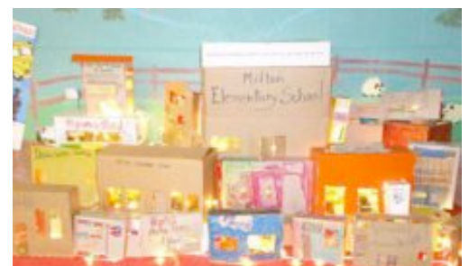
Diorama displays created by Milton After School Kids (MASK) for their Lights On! event in October.

This year we set a goal to double the number of sites holding Lights On Afterschool! events and we well surpassed it. In 2011 we had 43 registered events; in 2012 we had 125! We are so proud of how these programs highlighted the great work being done in VT afterschool and summer programs.