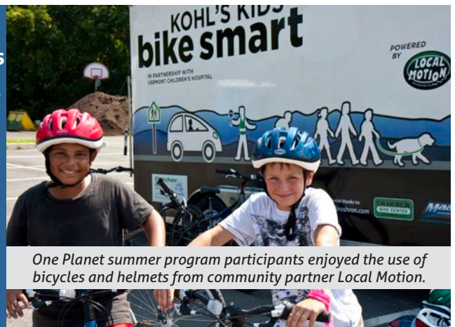
One Planet summer program participants enjoyed the use of bicycles and helmets from community partner Local Motion.