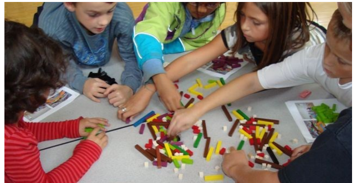
Building Fun—Friends—The Future in MJCC School Age