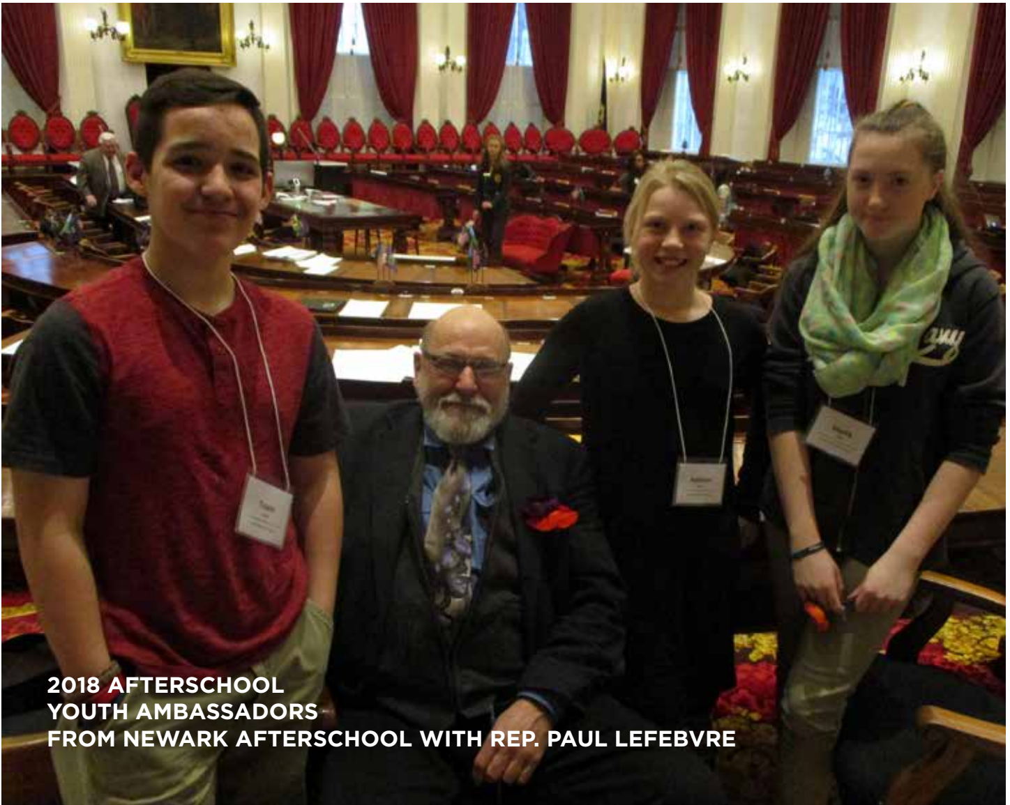
2018 AFTERSCHOOL YOUTH AMBASSADORS FROM NEWARK AFTERSCHOOL WITH REP. PAUL LEFEBVRE