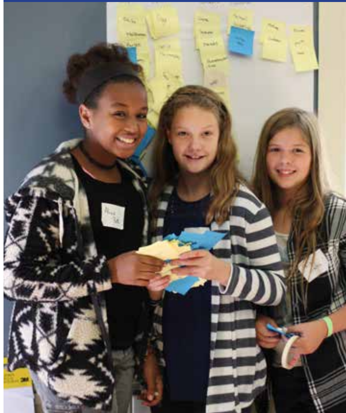
The VT Department of Health has stepped forward as a new partner in this work, providing Vermont Afterschool with a grant to fund a youth voice coordinator at the network and support a Finnish-style participatory budgeting process.